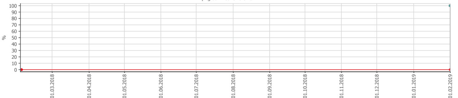
Business Process Digitalt Depot prt-g-adminsone.kdrs.no