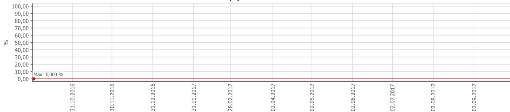
Business Process Digitalt Depot prtq-adminsone.kdrs.no