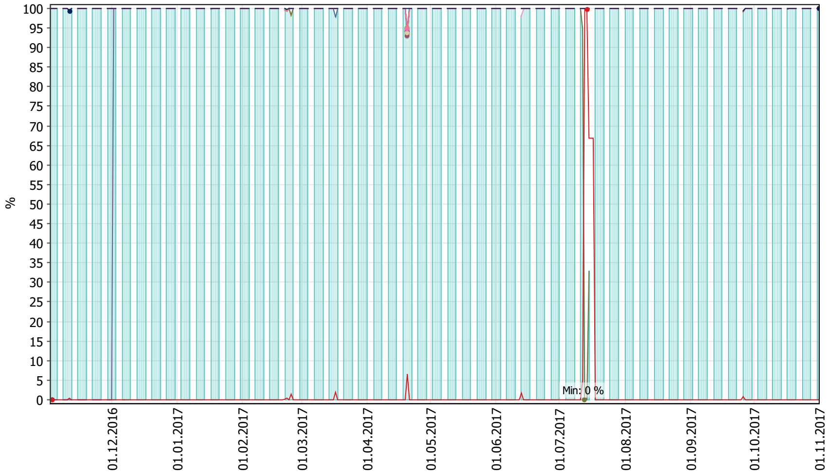
Business Process Digitalt Depot prtg-adminsone.kdrs.no