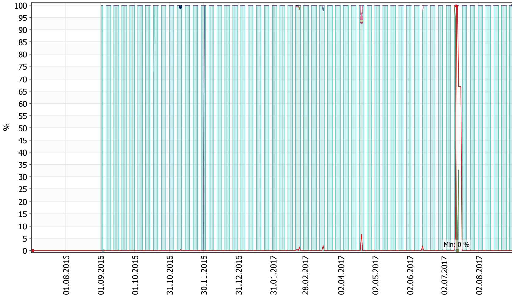
Business Process Digitalt Depot prtg-adminsone.kdrs.no